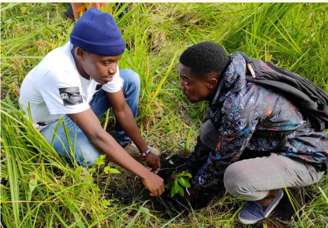
14. Don Bosco Green Club