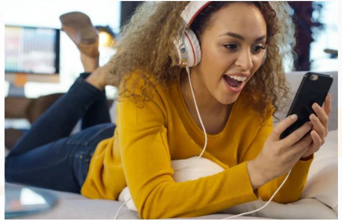
22. Online Communication