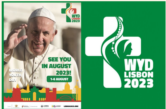
34. World Youth Day 2023