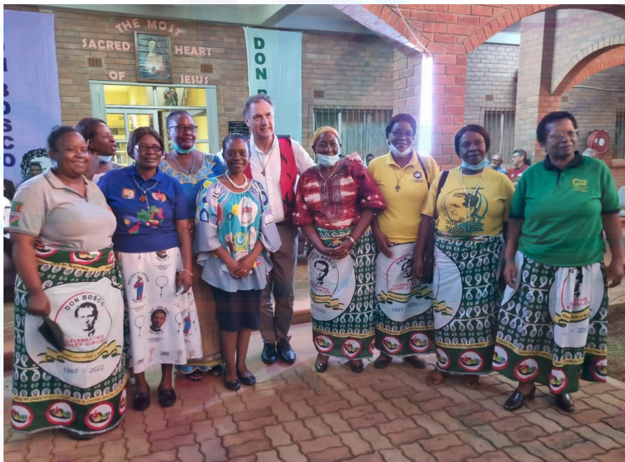
Lusaka Cooperators with the Rector Major at Makeni Post - Novitiate - Lusaka

66 PEOPLE WHO WISH TO DEVOTE THEMSELVES TO WORKS OF MERCY IN A SPECIFIC RATHER THAN A GENERAL WAY.