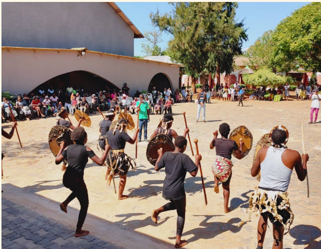
24. The Importance of Culture in today's lives