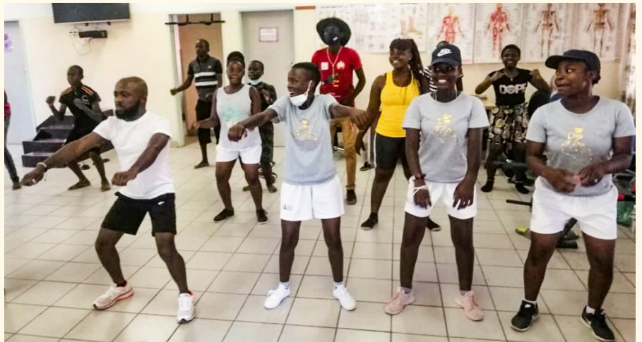
An initiative by the Salesian Youth Movement from Hwange, Under Laudato si "A healthy mind in a healthy body"