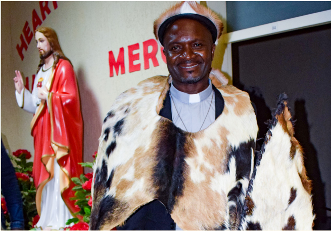
6. Installation of the ZMB New Provincial Superior