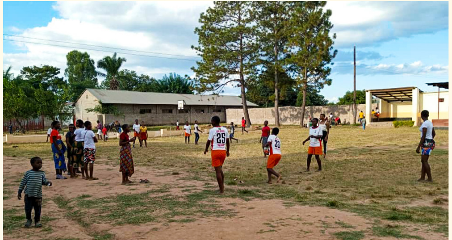
Salesian Youth Movement - Kazembe, Zambia during the celebration of the feast of Mary help of christians