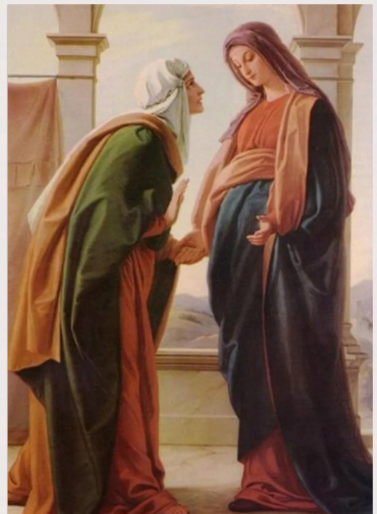
Mary arose and went with haste (Lk 1:39)