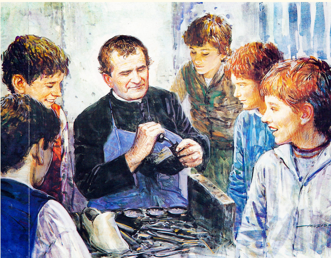
10. Our Ministry to the Poor in ZMB Vice Province