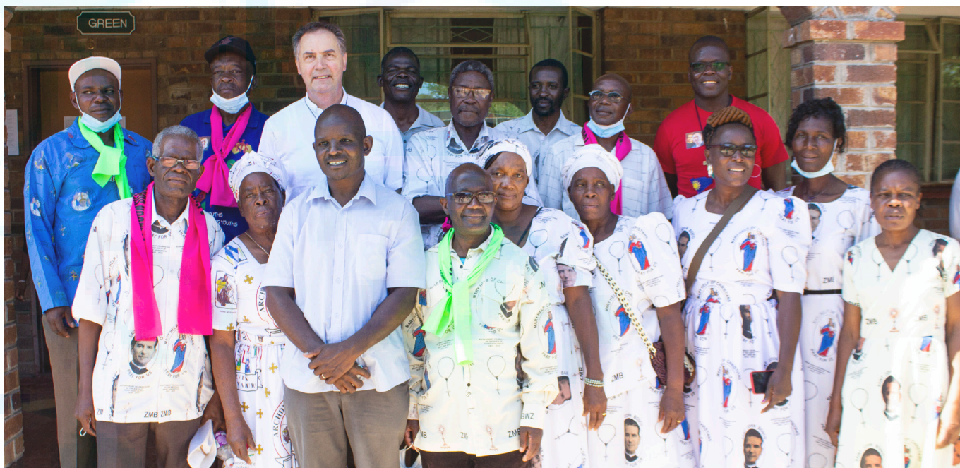
Hwange and Harare Cooperators with the Rector Major at Don Bosco Technical College - Hwange