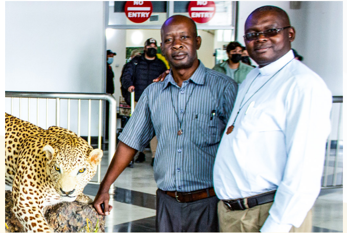
8. Our Salesian Charism in Southern African region