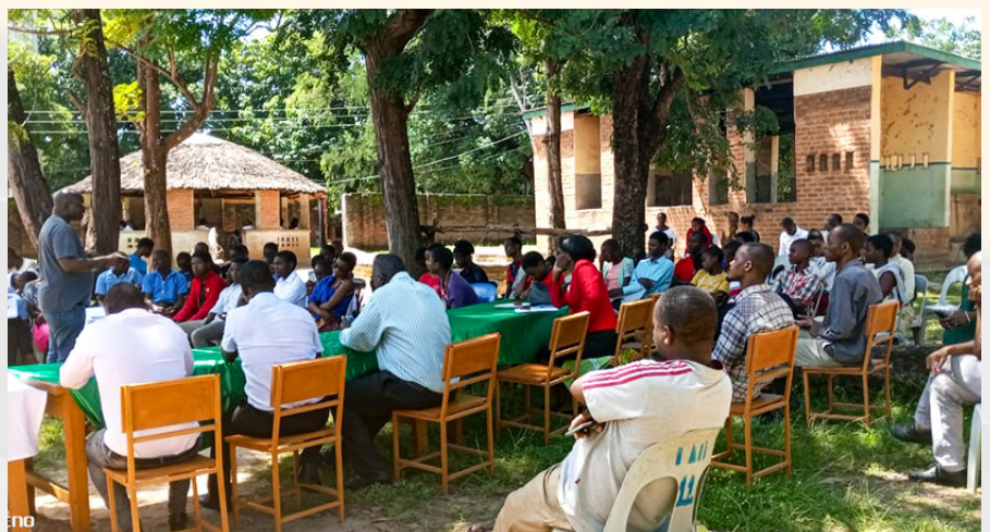
Salesian Youth Movement in Nkhotakota had a career talk and motivation from different professionals