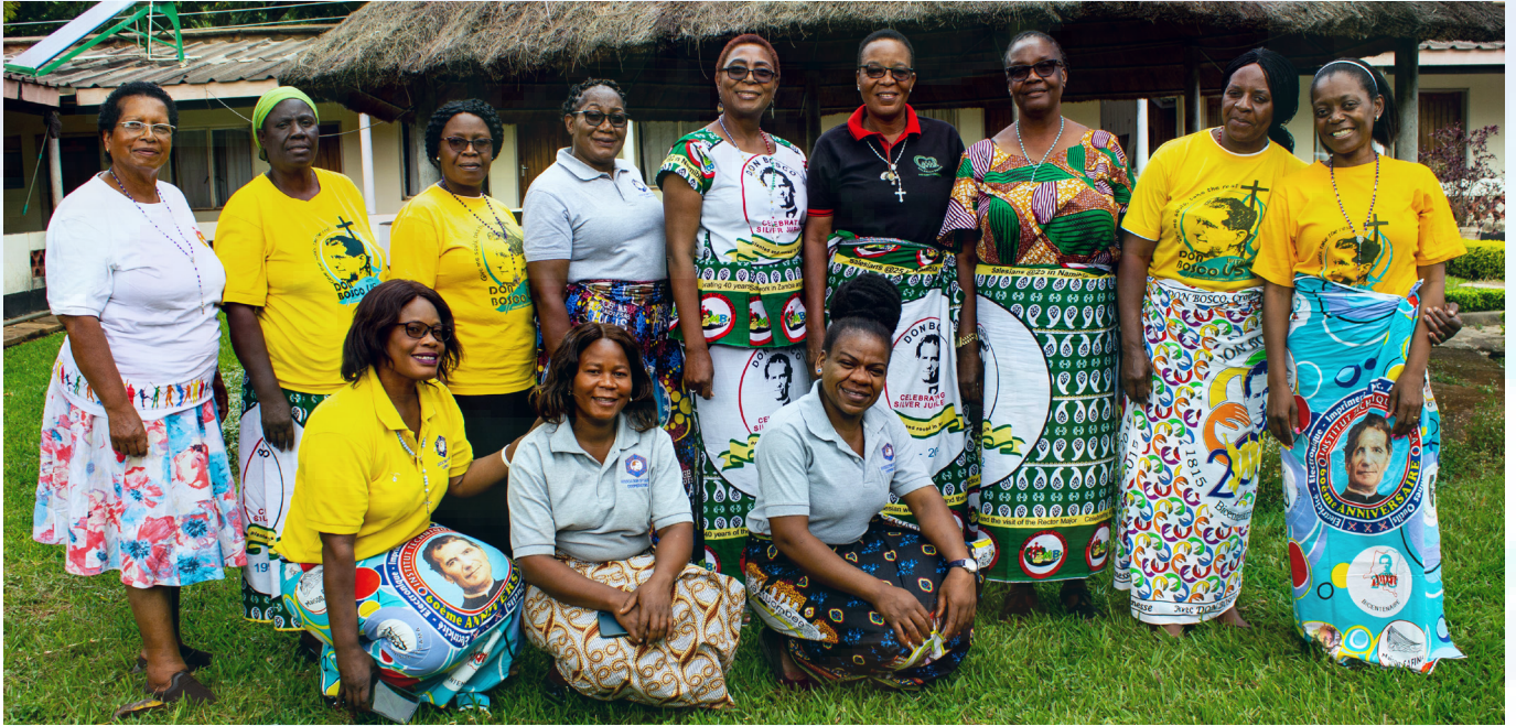
Lusaka Cooperators during their recollection at St. Joseph's Community - Bauleni