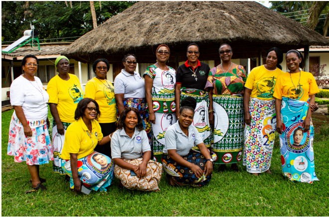
20. ZMB Salesian Cooperators