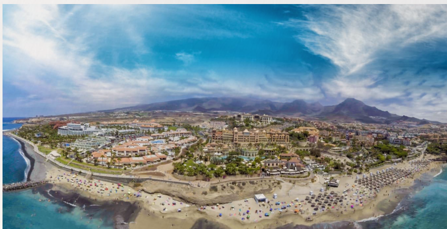
The islands of Tenerife and Grand Canary

just like these, addressed to Don Bosco and to the educators who are at their side every day in Don Bosco's name.