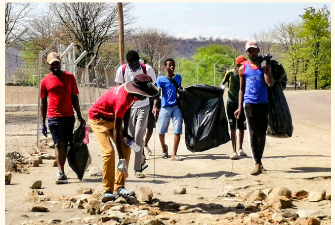
16. ZMB Salesian Youth Movement