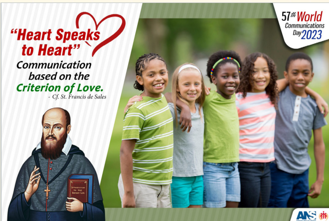
28. World Communications Day 2023