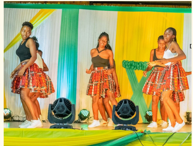
12. ZMB Community News