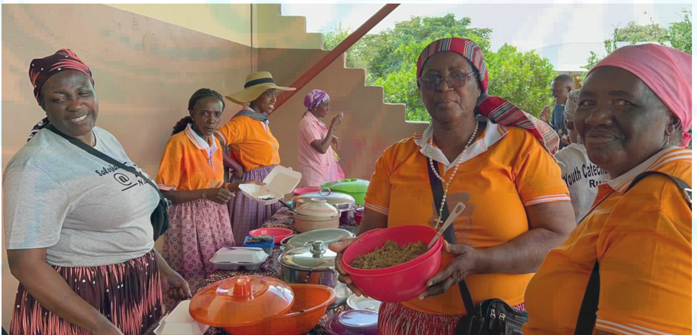
Rundu Cooperators serving food to the youth on Independence Day at St. Don Bosco Parish