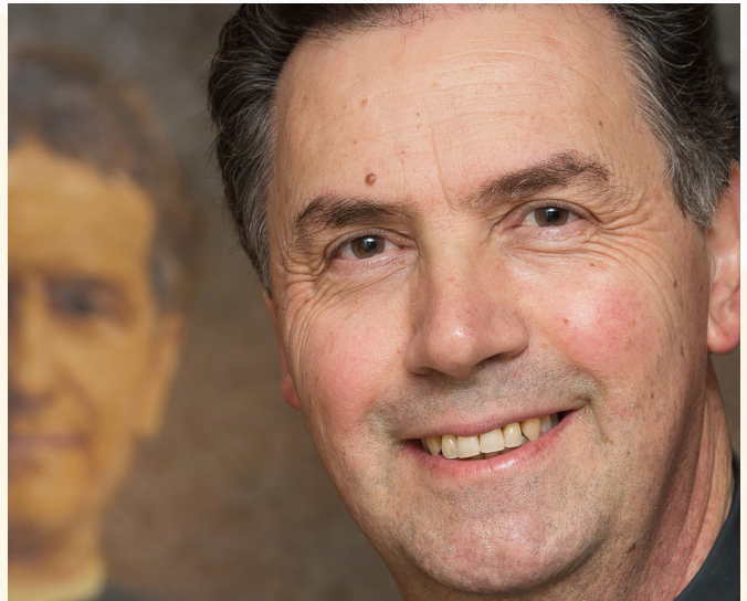
26 The Message of the Rector Major